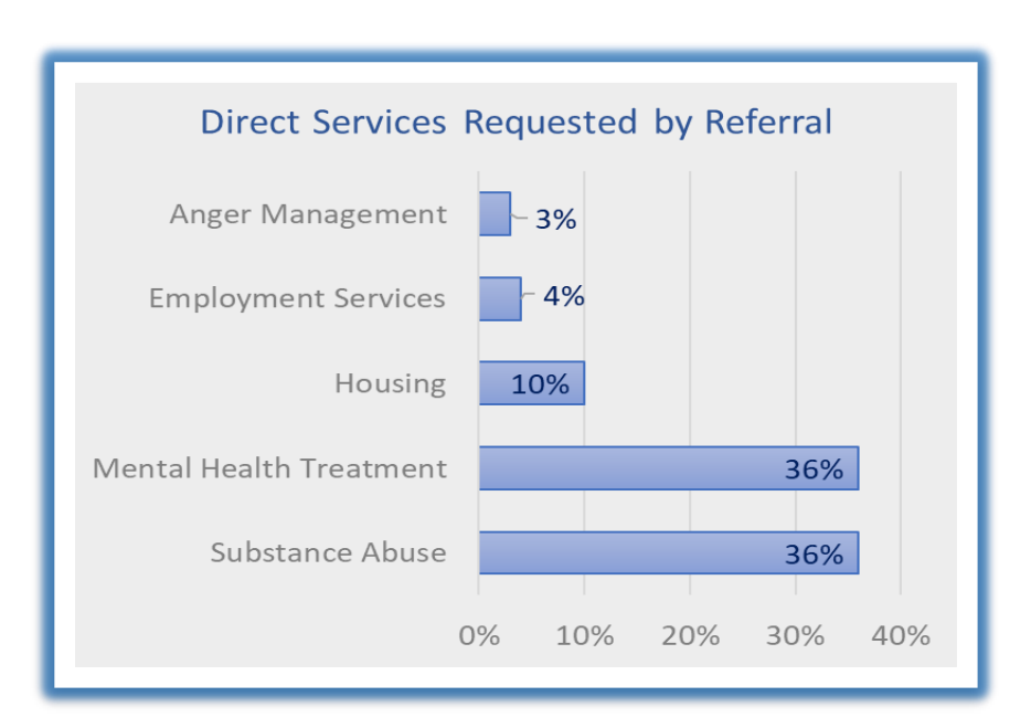
Figure 3: Types of Services Requested for Clients July 22 through December 31, 2022.

Though the majority of social services requests involve direct services, those referrals seeking the preparation of mitigation reports and re-entry or release plans are the most labor-intensive requests.