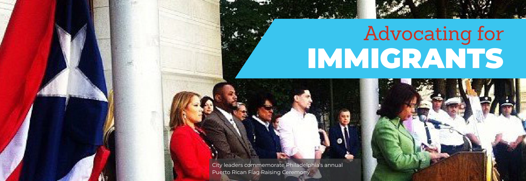
City leaders commemorate Philadelphia's annual Puerto Rican Flag Raising Ceremony